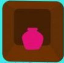
2. (a) Paniyara